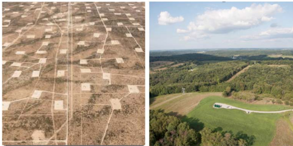
Figure 2 Innovation in well design and operation. Left: old single well spacing (Texas); right: modern multi-well cluster configuration accessing gas from an area of up to 10 km 2 (Pennsylvania).